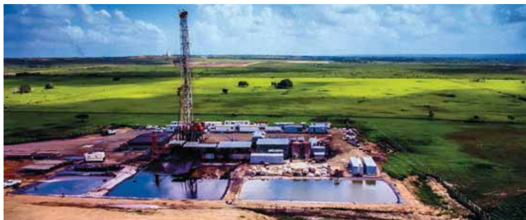
Produced water from onshore oil & gas drilling can be treated for reuse in hydraulic fracturing, irrigation, and other industrial operations.

The report goes on to explain: “Additionally, the list of produced water chemicals identified in this chapter is almost certainly incomplete. As discussed in Chapter 7, chemicals and their metabolites may go undetected because they were not included in the analytical methodology, or because an analytical methodology was not available. Chemical analysis of produced water can also be challenging because high levels of dissolved solids in produced water and wastewater can interfere with chemical detection. As a result, there are likely chemicals of concern in produced water that have not been detected or